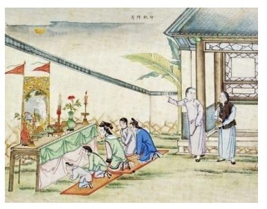
Praying to The Moon During Midautumn Festival". The drawing comes from the Atlas of Beijing Customs, compiled by Masaru Aoki with commentaries by Uchida Michio

summon a Taoist master to perform a special fertility rite. Among common people, there is also a custom of praying to the moon during the festival and asking for children.