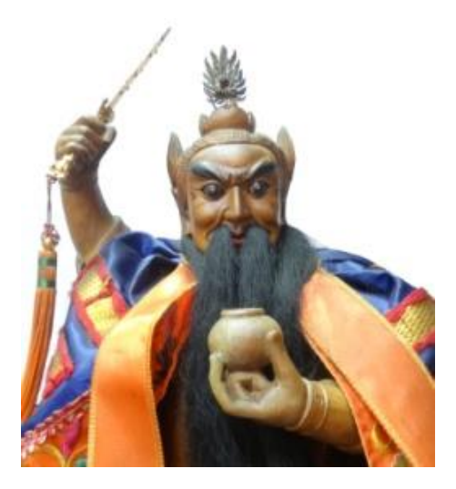
Ancestral Celestial Master Holding Alms